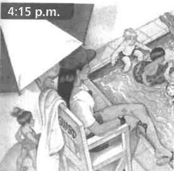
It's four fifteen. It's a quarter after four. It's fifteen after four.