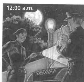
It's midnight. It's twelve o'clock.