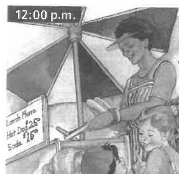
It's noon. It's twelve o'clock.