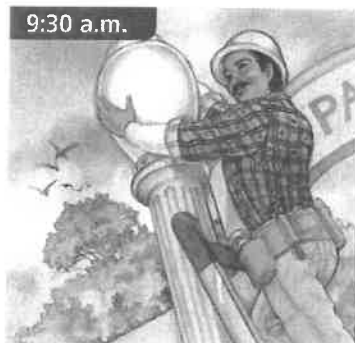
It's nine thirty. It's half past nine.