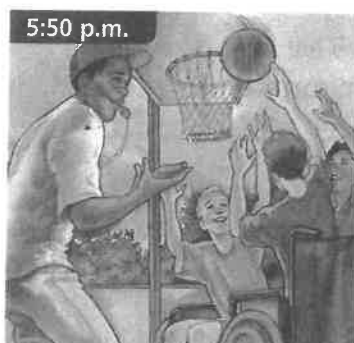
It's five fifty. It's ten to six. It's ten of six.