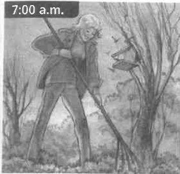
It's seven o'clock.